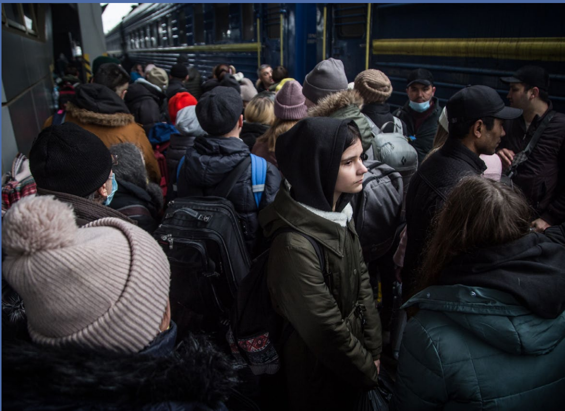
People fleeing the war-affected regions of Ukraine.

The war has had a devastated impact on Ukraine's economy and people's livelihoods. According to the World Bank data, Ukraine's GDP shrank by 37.2 percent in the second quarter of 2022 compared to the same period in 2021. The poverty and social impacts of the war are expected to be massive.