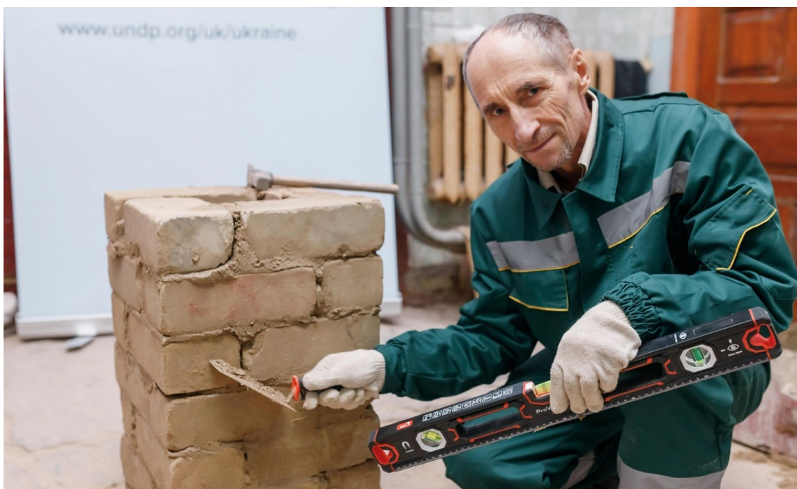
The practical lesson for bricklayers.