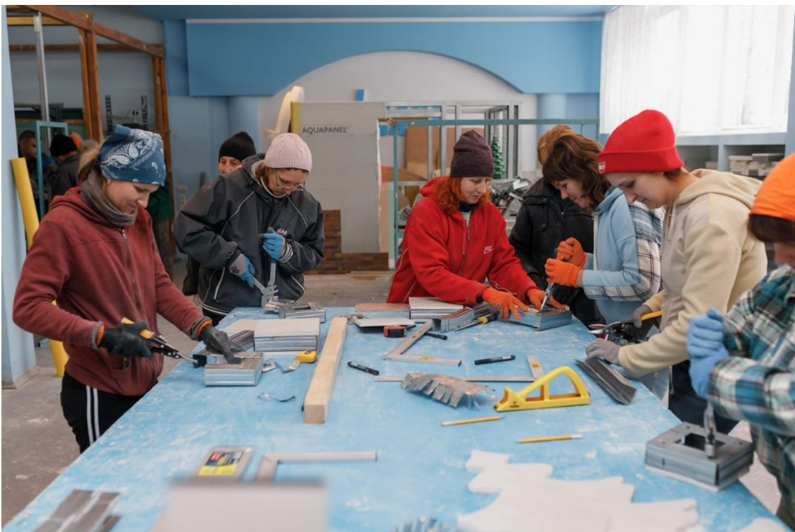
The practical lesson for installing plasterboard structures.

During November-December 2022, the Project organized training courses for mastering partial competencies in labour construction professions. In total, 45 (nine women) residents of Chernihiv and nearby communities, who needed to restore housing destroyed because of hostilities, took part in the training programme. The courses covered three labour construction professions/specializations which are currently most in-demand: