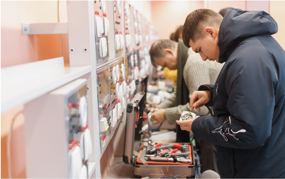
The practical lesson for electricians for lighting and lighting networks.

The training programme was conducted on the basis of the Chernihiv Vocational Construction Lyceum and the Chernihiv Vocational Lyceum of Railway Transport. Having acquired new skills and abilities, the course graduates can further form teams for the complex repair of damaged or destroyed property, and apply the acquired knowledge in everyday situations.